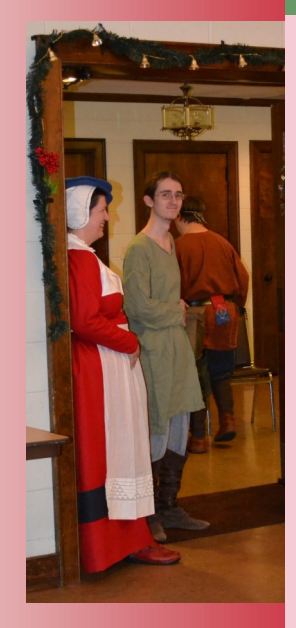
Tolir with the toy box, waiting to be hunted down by the children.