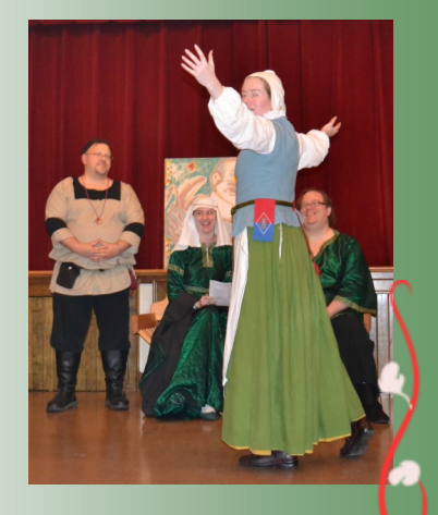
Commander of the Baronial Cat Army