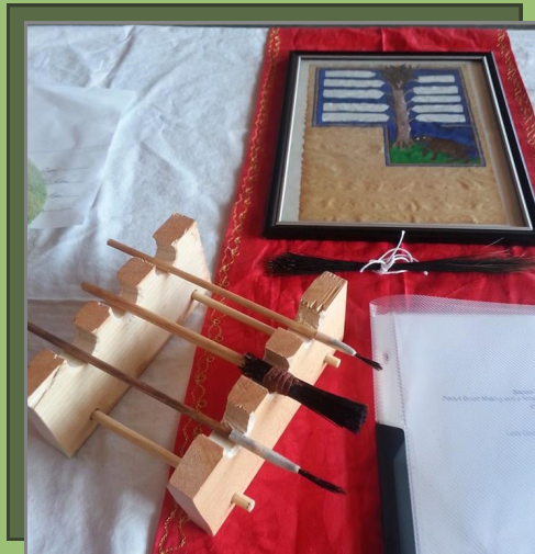
WINNER OF NON EDIBLE PIG A&S DIVISION-LADY OSA