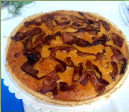
Lady Astrid pie